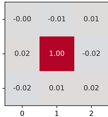
core_tensor[1, :, :]